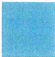
(Add student photo here.)